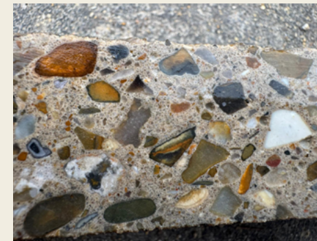
Discarded and reclaimed concrete pavers sawn to reveal beautiful terrazzo style edge for paving in garden