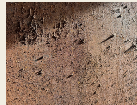
Reclaimed weathered steel road plates to provide retaining walls to the garden