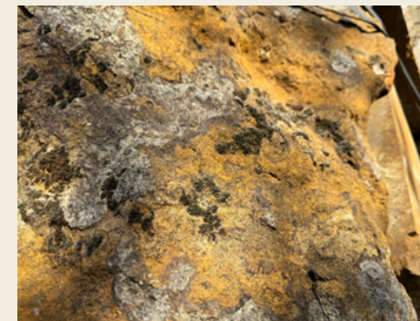
Reclaimed Ironstone to form seating elements in the garden